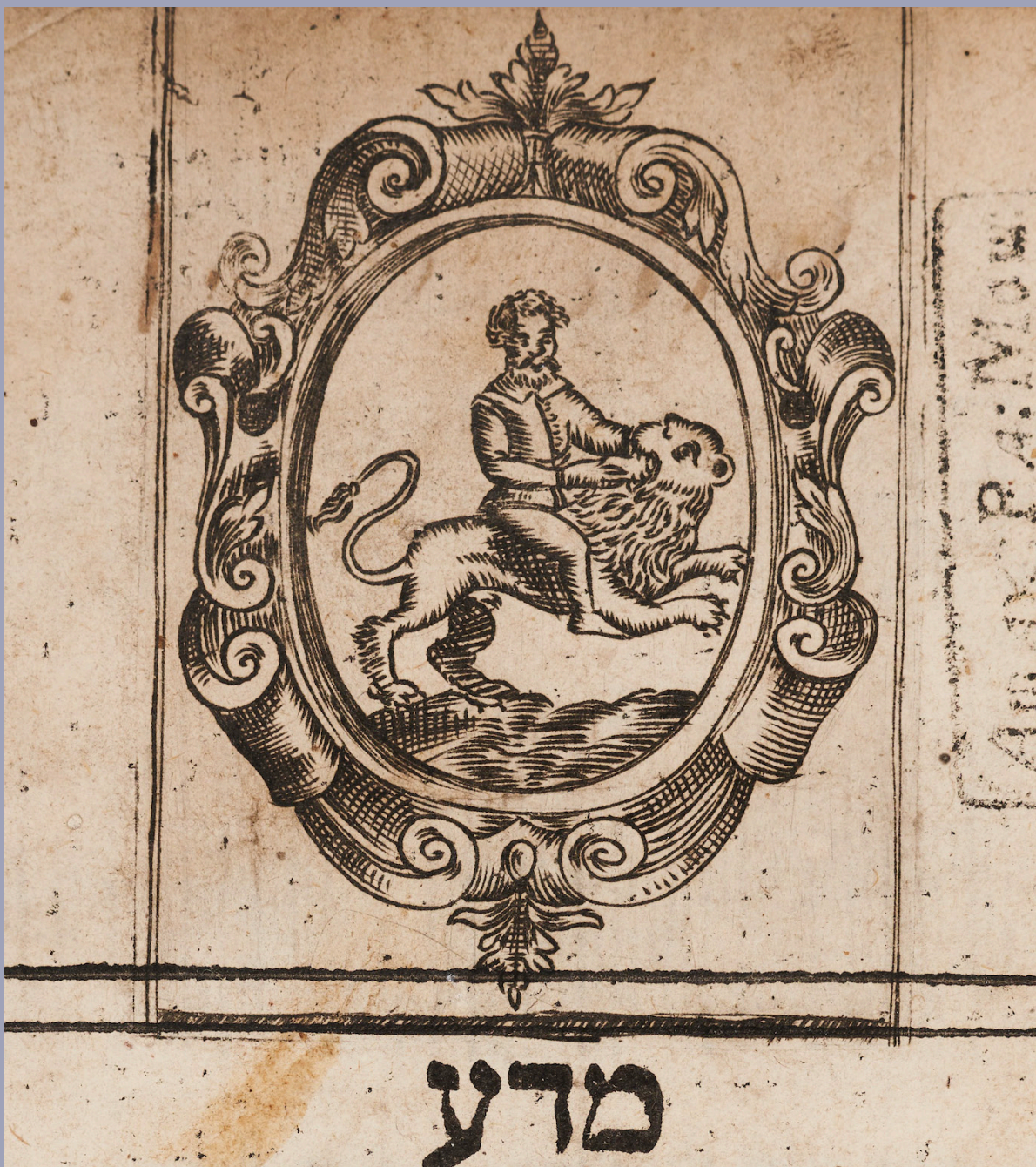
Mada, Ahavah, Zemanim (Venice, 1665), fol. 1r (detail), Hartman Family Collection, Photo by Ardon Bar Hama.

Monday 2.24.2025, 12:00 pm The Plimpton Room, Barker Center 133